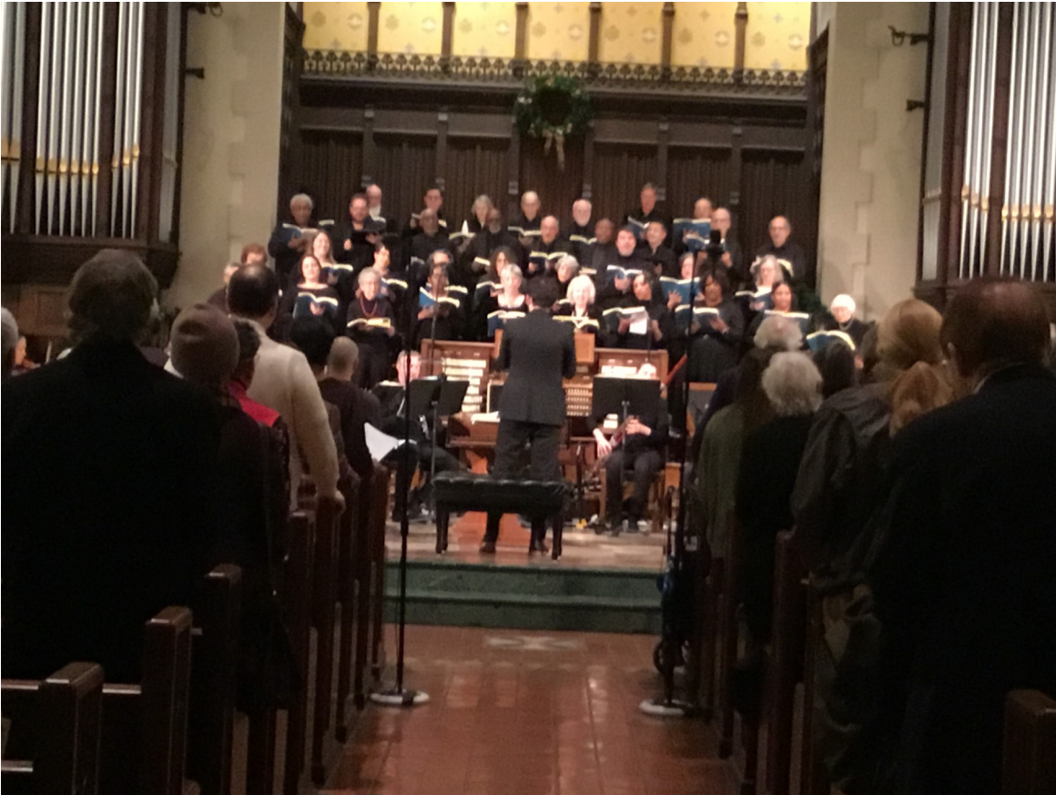
FPCG's 2024 Oratorio Choir performing Messiah .