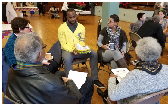
(A group of individuals engaged during Bible Study)

Our final 3rd Sunday event is on Sunday May 19th immediately following worship. This interactive intergenerational bible study will focus on Jesus inviting children to come to him. Join us as we share the word together. We are guaranteed to have a good time.